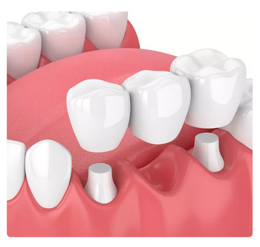
To make a 3 tooth bridge, the adjacent teeth have to be filed down

Once the implant has healed, an abutment and single crown is placed by your restorative dentist. This approach eliminates the need to file down your adjacent teeth.