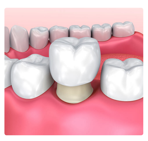
The implant has been restored with a crown.